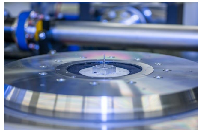
Fig. 6 The actual sample holder is located in the aperture of the rotation stage on the moving platform of a six-axis parallel kinematics

A six-axis parallel-kinematic machine of this type is also used for the positioning of the optics. In nanotomography, which allows three-dimensional micrographs with resolutions below 100 nm, this machine is used to align compound refractive lenses (CRL) in the beam with high precision.