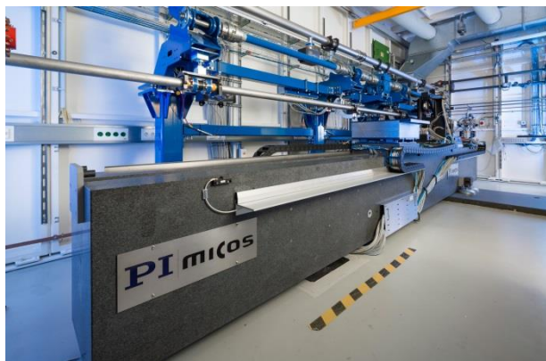
Fig. 1 At the X-ray light source PETRA III at the DESY research center (German Electron Synchrotron) in Hamburg, the Helmholtz-Zentrum Geesthacht - Center for Materials and Coastal Research (HZG) - operates the Imaging Beamline P05

Nowadays X-ray and tomographic methods help detect very fine structures inside objects. For spatial resolutions down to 100 nanometers, diffractive X-ray optics are available today. However, various challenges have to be overcome to obtain a three-dimensional image with volume resolution in this range. It is a major challenge to achieve the extremely high mechanical accuracy and stability required for the alignment of the optics and samples in the X-ray beam and for the entire experimental setup. Even minute changes in temperature or vibrations could degrade the desired resolution. This is why the improvement of the X-ray optics must always go hand in hand with the mechanical perfection of the entire setup. If specialists work closely together, considerable progress can be made as shown by the example described below.