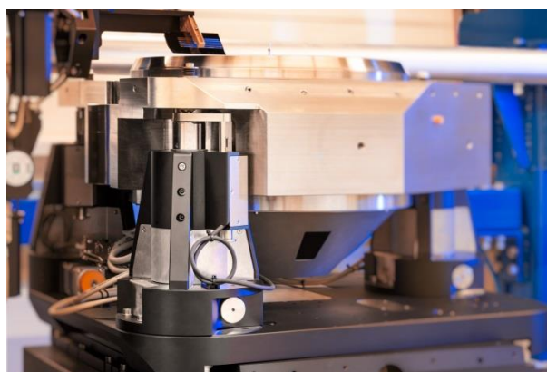
Fig. 4 The Z lifting stage performs the height adjustment, tilt correction, and orthogonal alignment, relative to the beam

What drives this high-precision positioning unit are stepper motors combined with high-resolution optical linear encoders. When driven accordingly, this allows closed-loop step sizes of a few nanometers. The precision crossed roller guides and ball screws used also contribute to the high positioning accuracy.