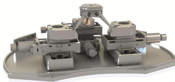
Fig. 7 Assembly principle of a SpaceFAB: The principle is based on three XY stages that jointly position a platform using three struts of constant length and a suitable joint configuration

It is the principle of choice in particular when long distances have to be covered in the X and Y directions or a low-profile design is required.