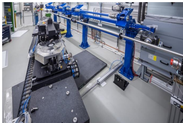
Fig. 3 The substructure, which weighs several tons, is mounted on air bearings. This allows the entire system to be moved out of the X-ray beam with minimal effort, while maintaining a stable position as soon as the air flow is switched off. The picture shows the assembly in the parking position outside the beam

A particular challenge was the construction of the sample stage, since it had to be mechanically stable in the range below 100 nm, in order to achieve the required spatial resolution. To this end, several positioning systems have to work hand in hand with maximum precision, to ensure that always the same volume element is investigated when the sample is rotating.